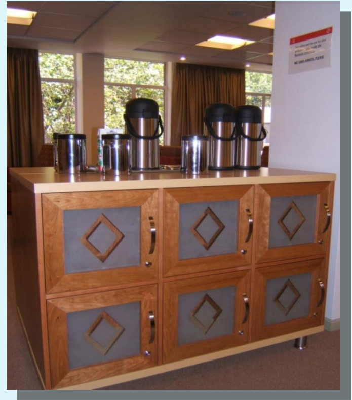
Complimentary coffee and tea